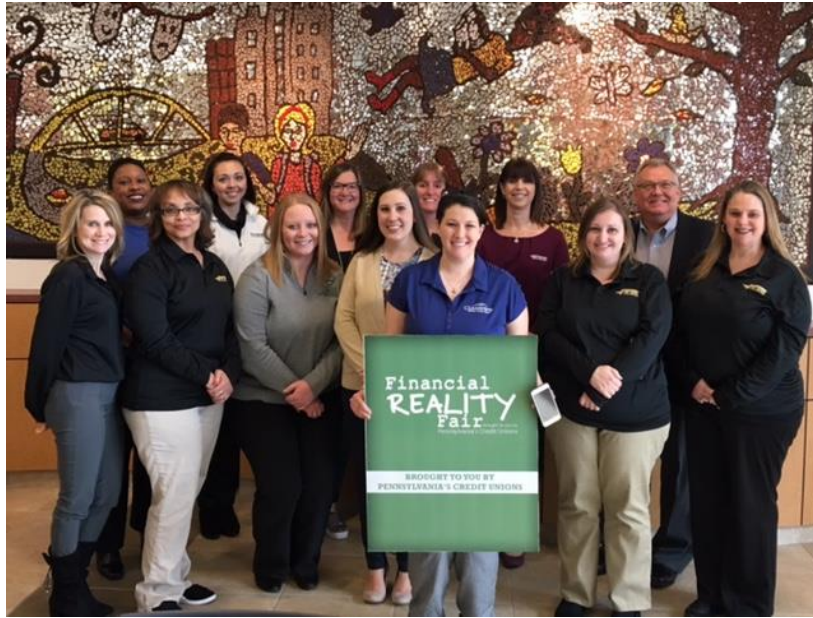
Reality Fair volunteers from Clearview FCU, Parkview Community FCU, Tri-Boro FCU, Visionary FCU and West-Aircomm FCU joined together to promote financial planning and literacy for Allegheny County high schoolers.